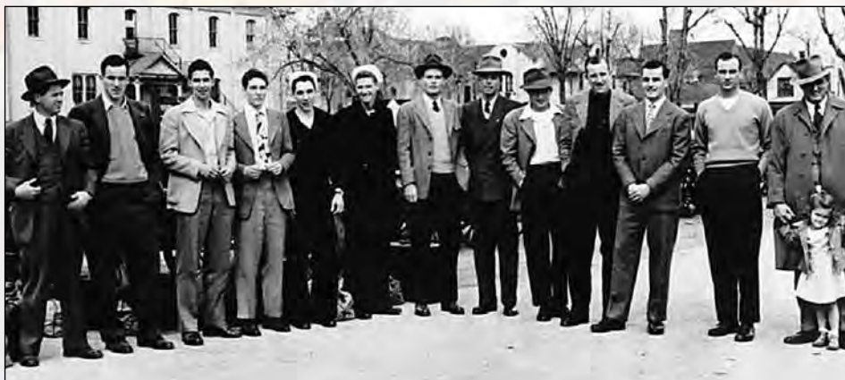
The 1946 Buff team heading for the NCAA Tournament.

March 29, 1919 — Colorado wins the RMC Eastern Division by downing Colorado A&M in Boulder, 32-18.