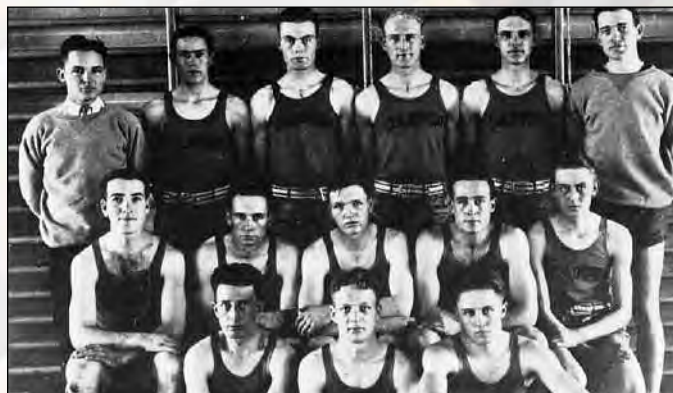
The 1929 Colorado Buffaloes won the Rocky Mountain Conference Eastern Division title.